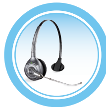
→ CS351 SupraPlus Wireless Monaural with Voice Tube