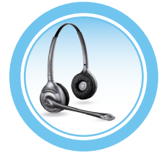
→ CS361N SupraPlus Wireless Binaural with Noise-Canceling